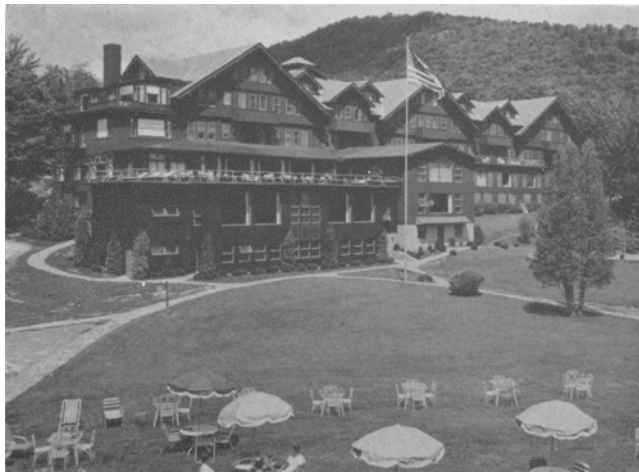
The Whiteface Inn at Lake Placid

The Short Course will be held at the Whiteface Inn, Lake Placid, New York.